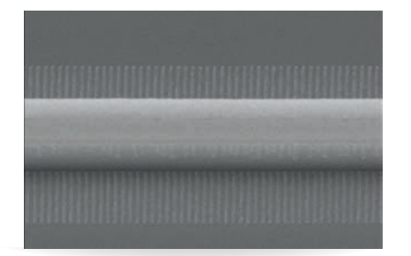
Overgrowth-free DFB device processing

Our excellent spectral purity is characterized by a large side mode suppression ratio (SMSR) of > 35 dB , giving your system a low signal to noise ratio against crossinterference.