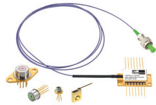
nanoplus DFB lasers on TO66, TO5, TO5.6, c-mount and SM-BTF

If you require custom specifications , please contact us. Nearly 80 % of our devices are more or less customer-specific. As nanoplus is a fully vertically integrated company , we control the entire process chain from design to packaging. Both nanoplus production facilities are based in Germany . To guarantee consistent product quality we apply a strict and ISO certified quality management system at all levels.