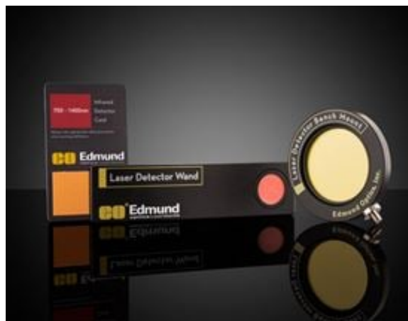
Laser Detection Products

激光检测产品(上转换片)可为使用紫外、可见和红外激光用户提供更好的产品性能和安全性。它们可以减少许多实际应用中与光束可视化、轮廓分析和对准相关的问题。每个产品系列都有三种型号。激光检测产品的层压信用卡式型号仅适用于低功率光源和反射观察。25 毫米圆盘和夹持棒式适用于需要频繁定位的部件。可拆卸的圆盘可安装在光学元件上, 以实现精确对准, 而夹持棒式的型号则便于在光路中进行操作。光学可安装平台头式具有较大的活动区域可使用 1/4-20 螺纹安装, 可与标准英制接杆/接杆套筒一起使用。