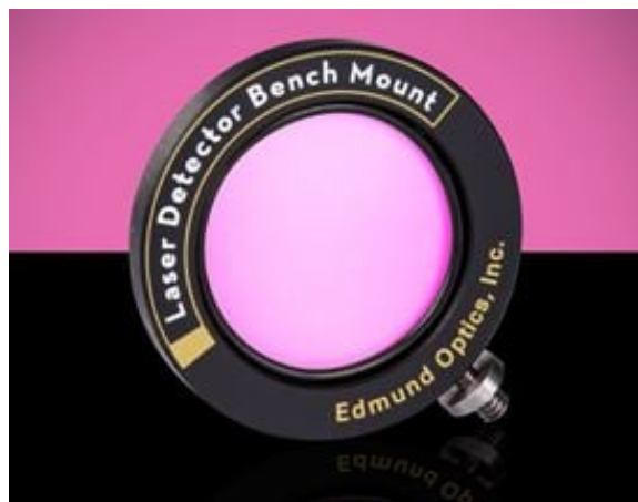
Bench Mounted Laser Detection Head VIS, #55-297

激光检测产品(上转换片)可为使用紫外、可见和红外激光用户提供更好的产品性能和安全性。它们可以减少许多实际应用中与光束可视化、轮廓分析和对准相关的问题。每个产品系列都有三种型号。激光检测产品的层压信用卡式型号仅适用于低功率光源和反射观察。25 毫米圆盘和夹持棒式适用于需要频繁定位的部件。可拆卸的圆盘可安装在光学元件上, 以实现精确对准, 而夹持棒式的型号则便于在光路中进行操作。光学可安装平台头式具有较大的活动区域可使用 1/4-20 螺纹安装, 可与标准英制接杆/接杆套筒一起使用。